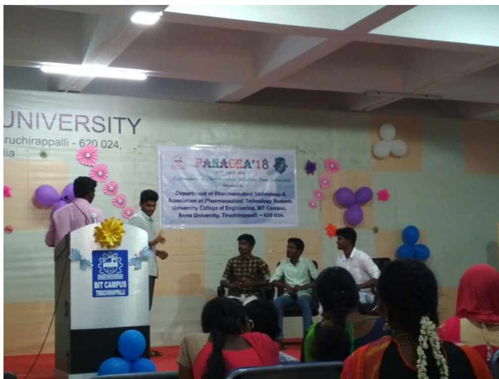
Fig. The students were eagerly participating in the events conducted in the symposium

The growing enrollment of students with migrant backgrounds has brought unique opportunities to conduct student’s symposium entitled PANACEA’18, mainly to promote the sharing of best practices and analyses on how to address the varied needs of these youth, teacher, educators and future researchers. The symposium explored the imperative of improving educational outcomes for students. Various Technical and Non-technical events were organized, and students willingly participated in all the events. The technical events included Paper presentation, Poster presentation, Project Expo, Pharma-auction and Techno-quiz. The Non-technical events included Ad zap, Dumshradas, Meme creation, Photography. At the end of the symposium, Prizes were distributed to all the winners. Participation certificates were also given to all the delegates.